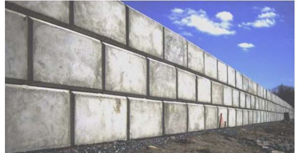
2' x 2' x 4' Plas-Crete Blocks, 6 feet high